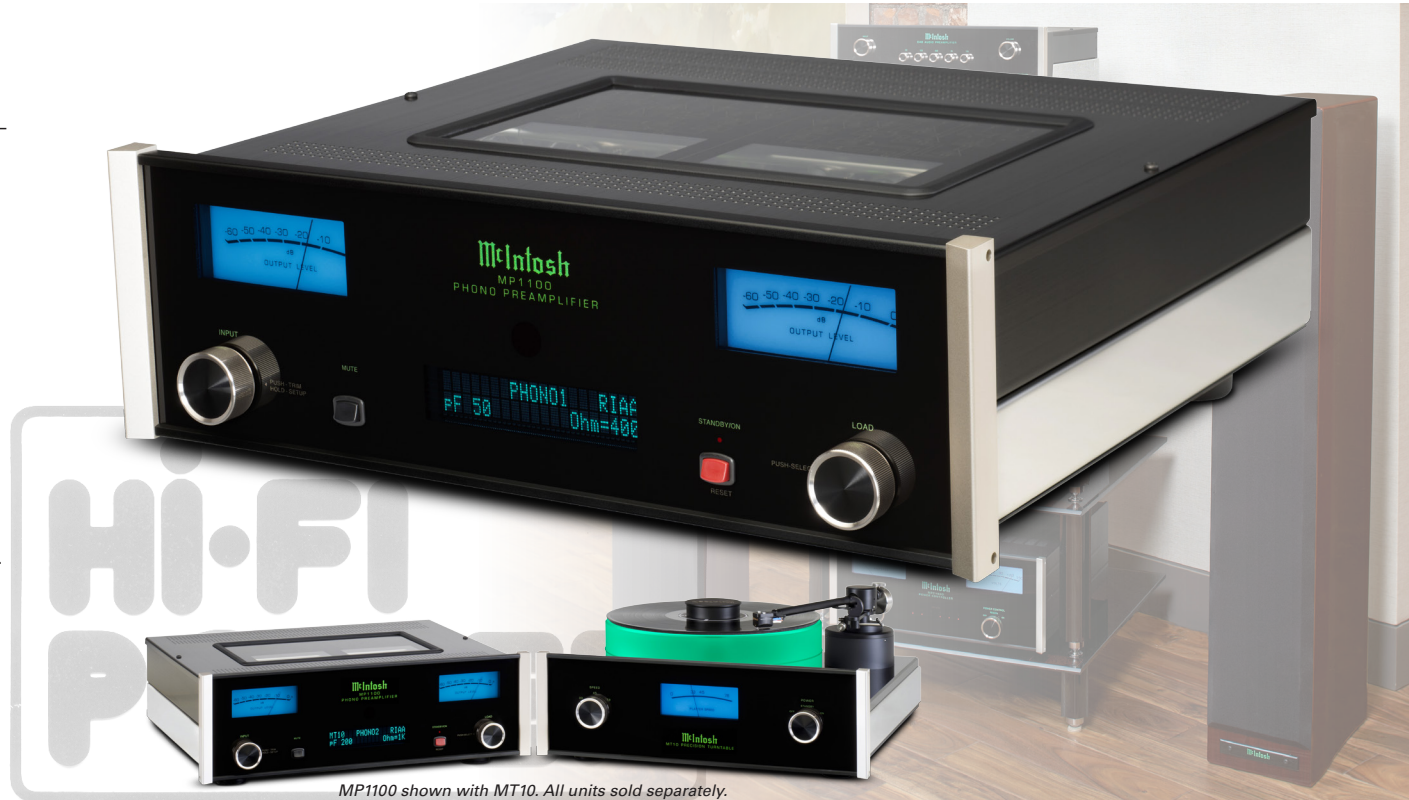
MP1100 shown with MT10. All units sold separately.