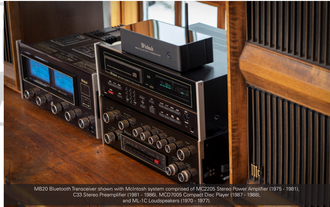
MB20 Bluetooth Transceiver shown with McIntosh system comprised of MC2205 Stereo Power Amplifier (1975 - 1981), C33 Stereo Preamplifier (1981 - 1986), MCD7005 Compact Disc Player (1987 - 1988), and ML-1C Loudspeakers (1970 - 1977).