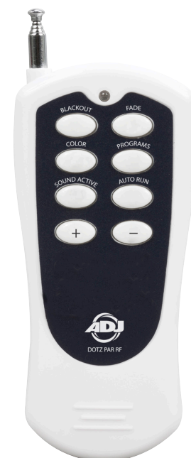
DOTZ PAR RF wireless remote control (sold separately)